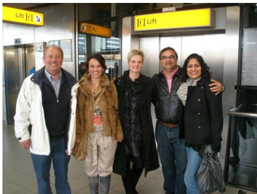
Young Africa International meets Young Africa USA on the 8 th of May at the National Airport Schiphol in the Netherlands.