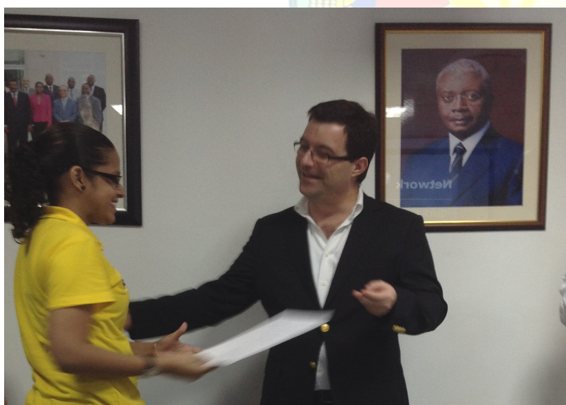
Delivery of certificates in Customer Service with Excellence training