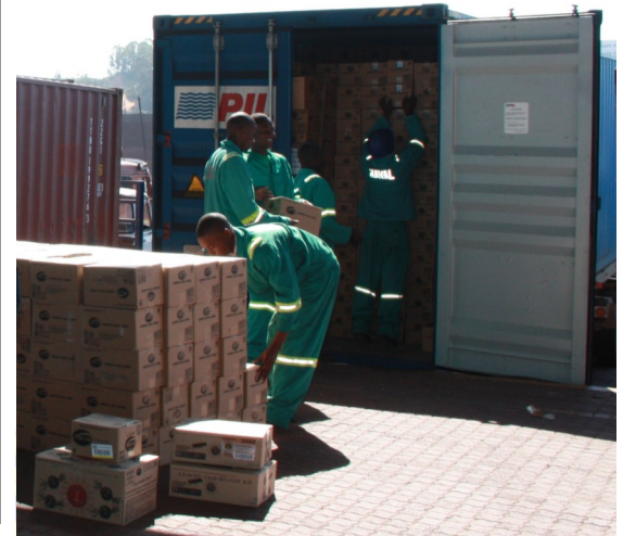
Physical Examination of goods

The maximization of the use of information captured through the new information and communication technology in the clearance process – SeW, was reflexion object in the workshop organized by the Customs Intelligence, Investigation and Audit Directorate.