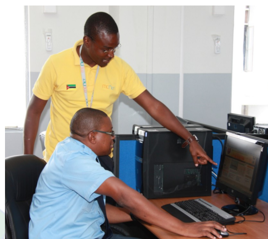
On site coaching

Alongside the uses training, the capacity building of the team members is also a prime component in order to enhance the quality of services provided to the trade external operators through SeW. In this context, SeW support and communication networks team members benefited from courses such as Customer Service with Excellence and in the informatics area Solaris Administration System, taught by specialized companies.