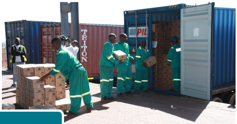
Physical Examination of goods

operationalization of the Authorized Economic Operator profile in SeW, approved by Ministerial Diploma 314/2012 of 23 November, by which the external traders operators has the possibility of clearing their goods free of any customs controls at time of arrival, contributing to the reduction of costs associated with the clearance process itself.