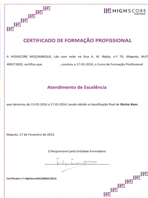
Certificate of Customer Service with Excellence training