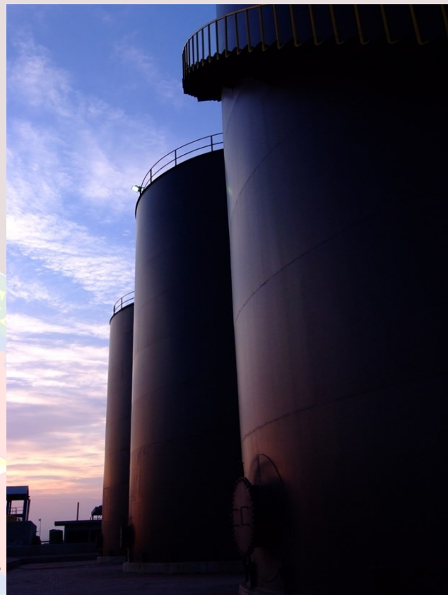
Petroleum Products Terminal

The implementation of the new modules and functionalities, whose preparation process includes users training sessions, sensitization actions between customs officers affected at customs areas as well as the several users of the public services provided through SeW, essentially aims to guaranty that the new functionalities respond to the real users needs for a slow migration of the actual environment to the electronic.