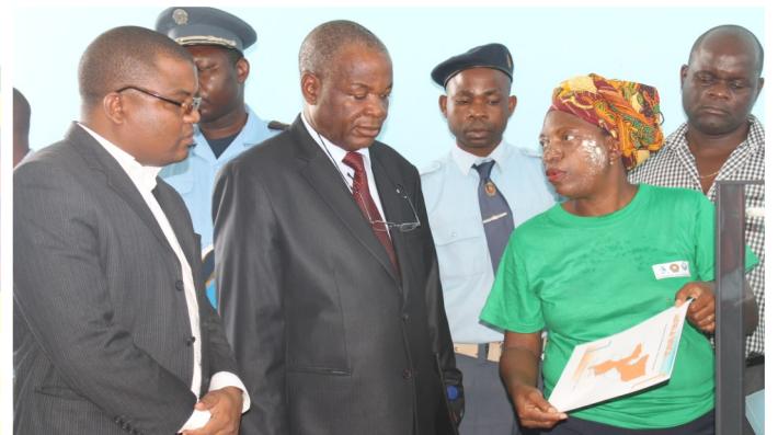
Celebration of World Customs day at the north regional directorate

The topic chosen by the international organism aligns with the assumptions of the introduction of the SeW system that forecast on its implementation plan the interconnection with some neighboring countries for a safe and efficient information exchange related to the cross-border trade.