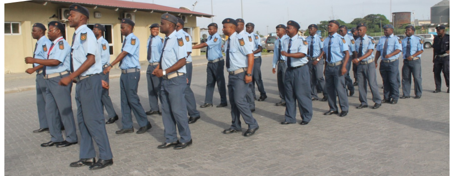
Military parade at the north regional directorate