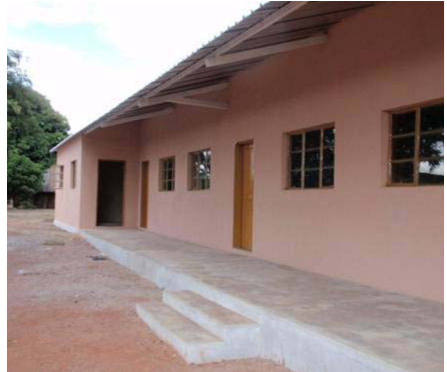
School at Nhatarara after Mozfoods CSR Project