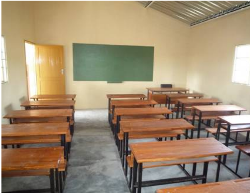
New classroom at Nhatarara school