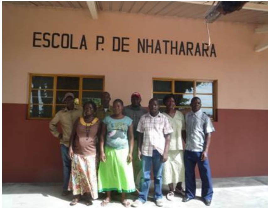
Staff at new Nhatarara School