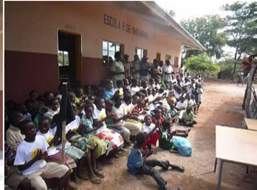
Students at new Nhatarara School