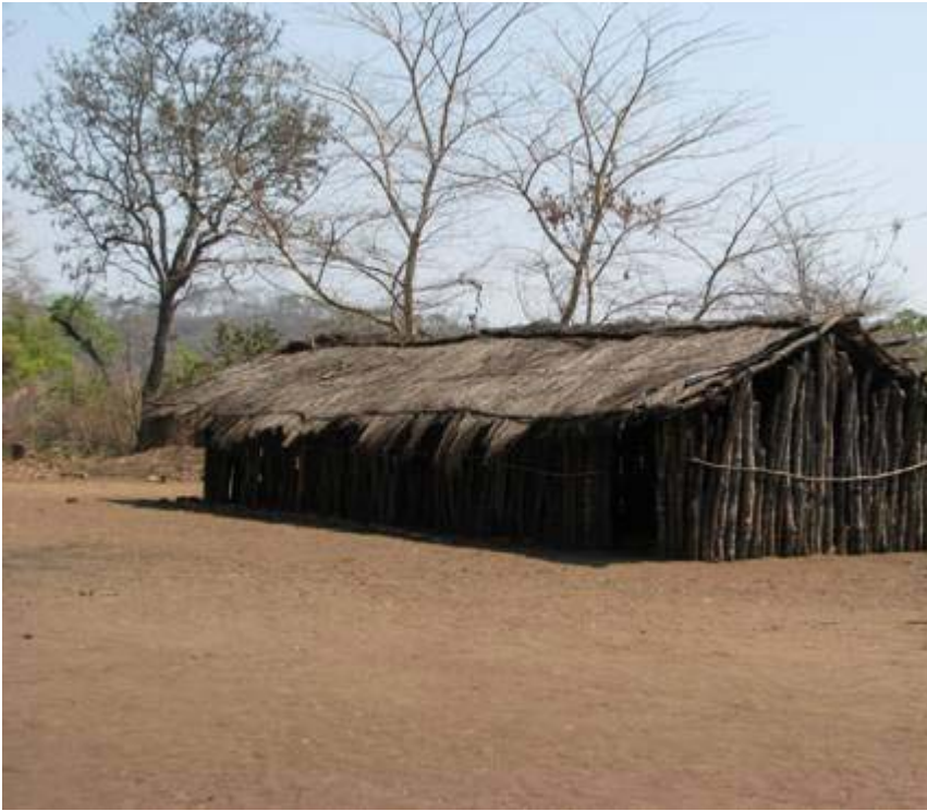
School at Nhatarara, before Mozfoods CSR Project

blog that followed the construction of the project.