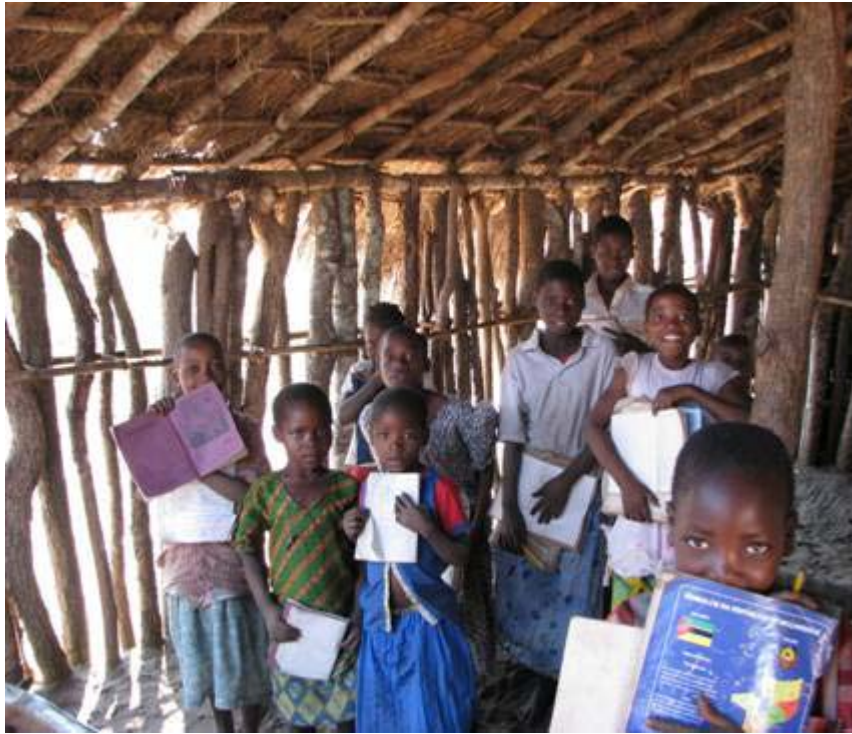
Old classroom at Nhatarara school

economy that we integrate. Our CSR strategy focuses on two main areas: