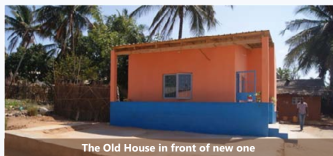
The Old House in front of new one

Ofcourse she was concerned as to what house she would receive but when the new house below was handed over she was incredible impressed. Now a few months later she welcomed us into her home and proudly showed us how beautiful her new house is and how thankful she is to MCA Mozambique and the government of Mozambique for keeping their promise and providing this house which was better than her old one.