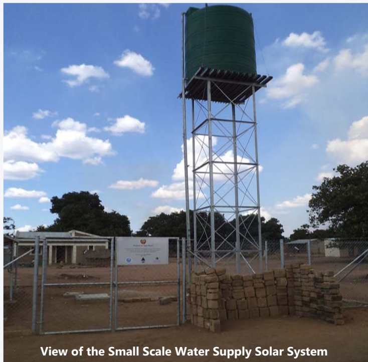
View of the Small Scale Water Supply Solar System

The Rural water supply project and the SSSS activity has a large impact especially with women and children as the time lost previously to carry water from a river to their village is now minimized allowing more time for other activities.