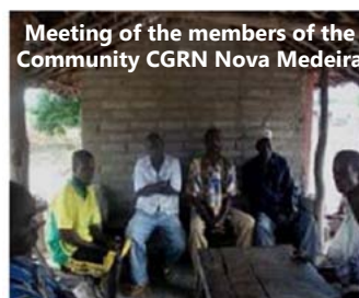
Meeting of the members of the Community CGRN Nova Madeira

Due to a lack of dialogue, and disorganization of the community, the projects have not progressed. The community did not benefit from the 20% of revenues from the exploitation of natural resources paid by different operator because the signed contract for exploitation of natural resources was between the company and the Government without involving the communities. In 2010, through the ITC and Concern Universal, we learned that the MCA-Mozambique would support communities to demarcate their lands. Because of the support of the MCA Mozambique, now we all know what the boundaries of the community of Nova Madeira. We also feel those local operators, already networking with the community and helping us to solve some problems, such as: human – Wild Life Conflict, creating jobs for our young boys and girls.