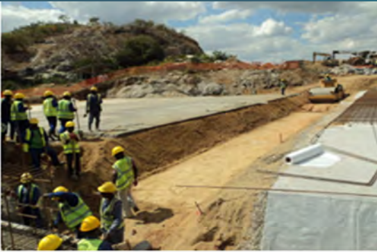
ETA2 foundation – Trench for the clarifier sludge drainage