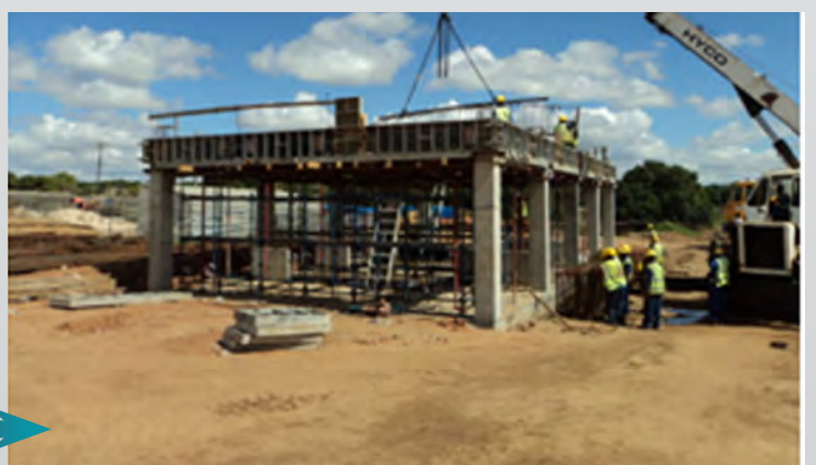
ETA2 Chemical Building – Placing the beam RS