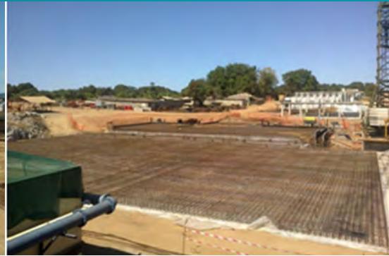
ETA 2 – View of the blinding concrete and RS preparation for the base slab