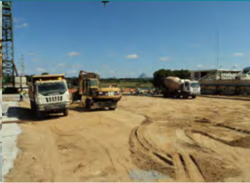
ETA2 foundation – Execution of blinding concrete layer