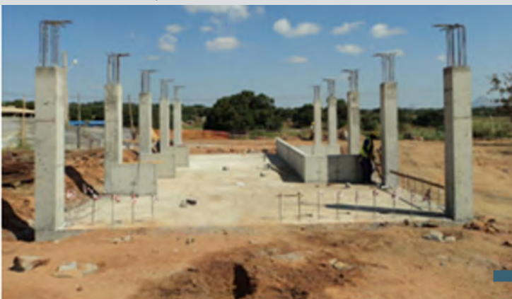
ETA2 Chemical Building – View of the Columns