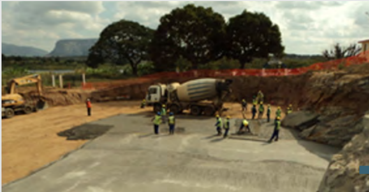
EB1A – Execution of the blinding concrete after completion of the excavation backfill

Lot 2 – Water Transmission Main and Distribution: Pipe laying from EB1A to EB2 – Total accumulative: 140 pipes (770m).