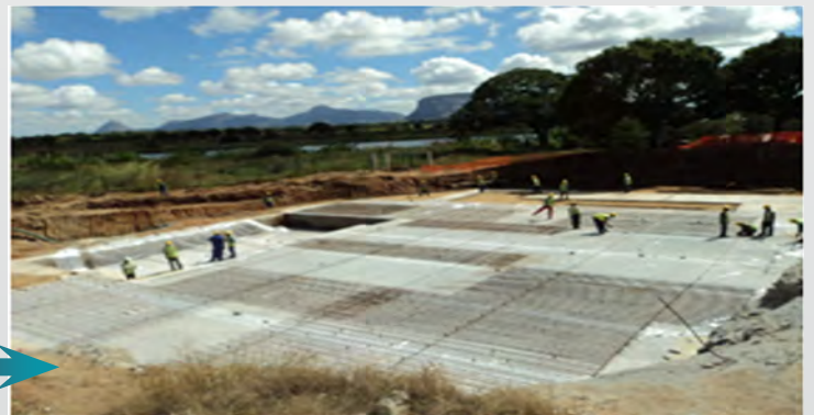
EB1A – View of the bottom slab