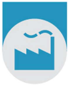
UTILITIES, INDUSTRY AND SERVICES