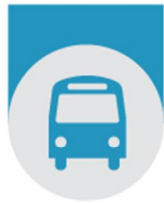
TRANSPORTS AND INFRASTRUCTURES