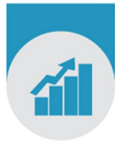
BAKING AND INSURANCE