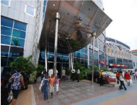
Mozambique is a country of contrasts: There are huge gaps between the shopping centre in Maputo ...

gress assessment. In addition, Sweden, the European Commission and Switzerland tie a small portion of their aid to chosen performance criteria.