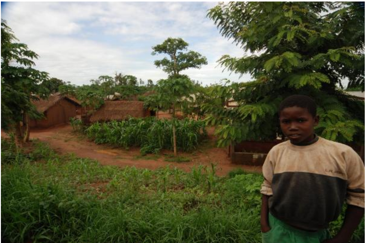
... and rural live, for example in Nampula.

In spite of the clear message expressing the donors' concern and the financial consequences for 2009 there were no initial reactions, neither from the side of the government nor was the issue taken up by the media. Apart from the local currency Meticaïs the US dollar is used in Mozambique. Since the exchange rate between the Euro and the dollar has improved considerably, the dollar amounts pledged for 2009 increased significantly in spite of cuts and hid stagnating and backward movements. Only when months later the Swedish ambassador reiterated the issue, a public debate emerged – about corruption as well as the donors' behaviour. The government reacted in an irritated manner. It said it was not informed, even though it chaired the annual meeting! And it accused the donors of interference in internal affairs. It is very rare for the Mozambican government to publicly criticise the donors. And civil society voices doubt whether the fight against