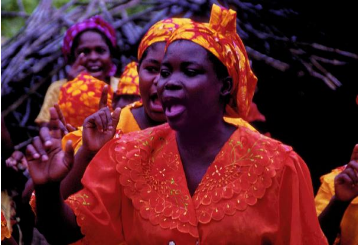
If the government fulfils its responsibilities, this is done at the service of the people.

debate is a matter of speculation. Also whether this is the start of a new era can not yet be decided. Either way, the measures take a direction which not only the donors but a large share of the population desire. And with regard to the upcoming elections this can not be meaningless for the government.